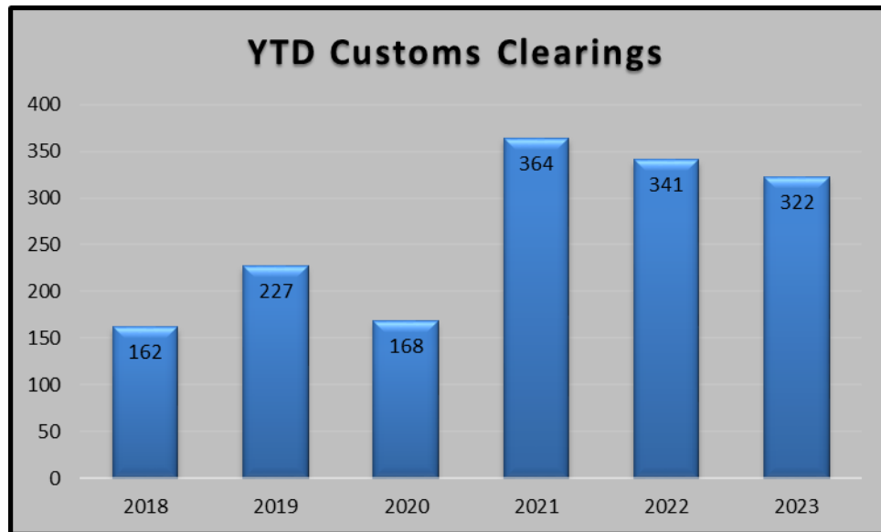
Customs Clearings Year to Date through August 2023