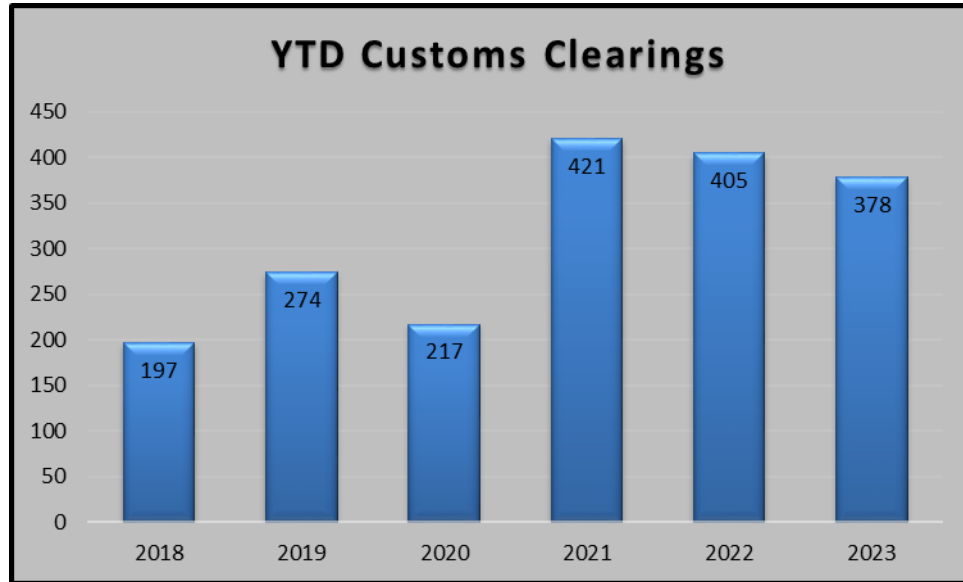
Customs Clearings Year to Date through October 2023