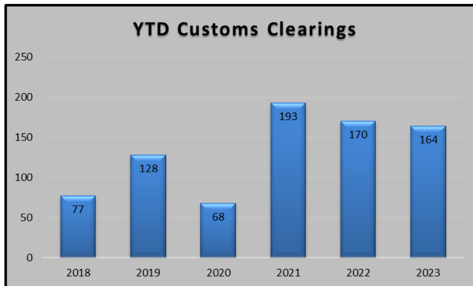
Customs Clearings Year to Date through April 2023