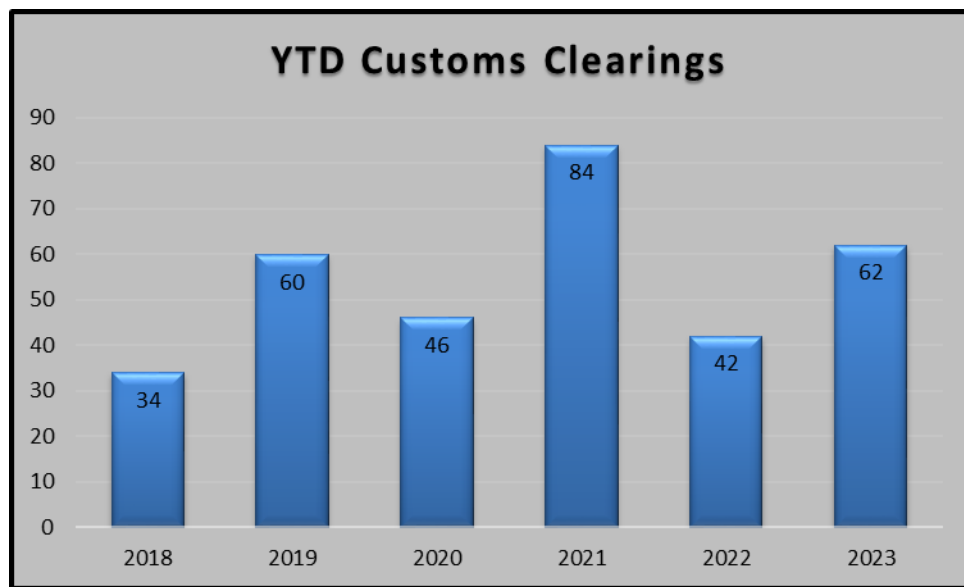
Customs Clearings Year to Date through February 2023