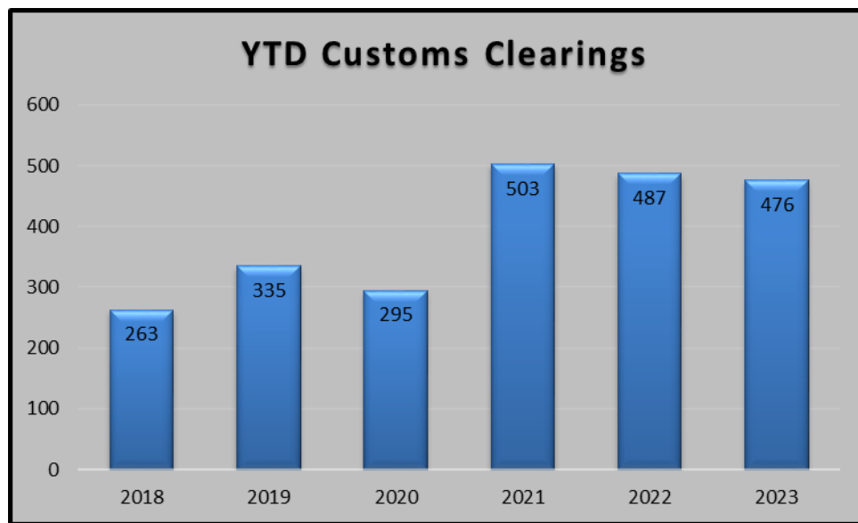
Customs Clearings Year to Date through December 2023