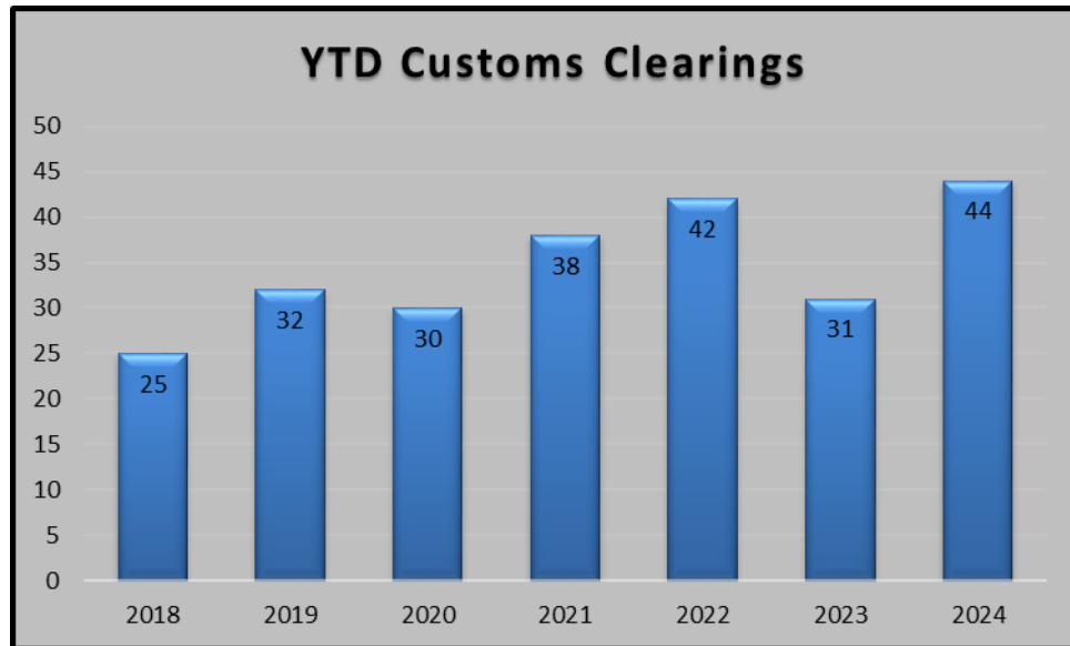
Customs Clearings Year to Date through January 2024