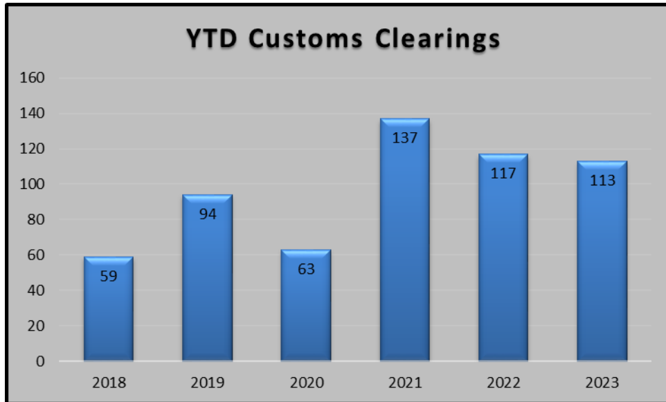
Customs Clearings Year to Date through March 2023