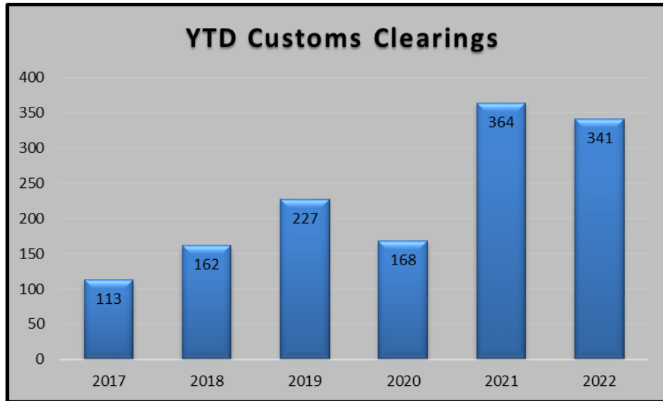
Customs Clearings Year to Date through August 2022