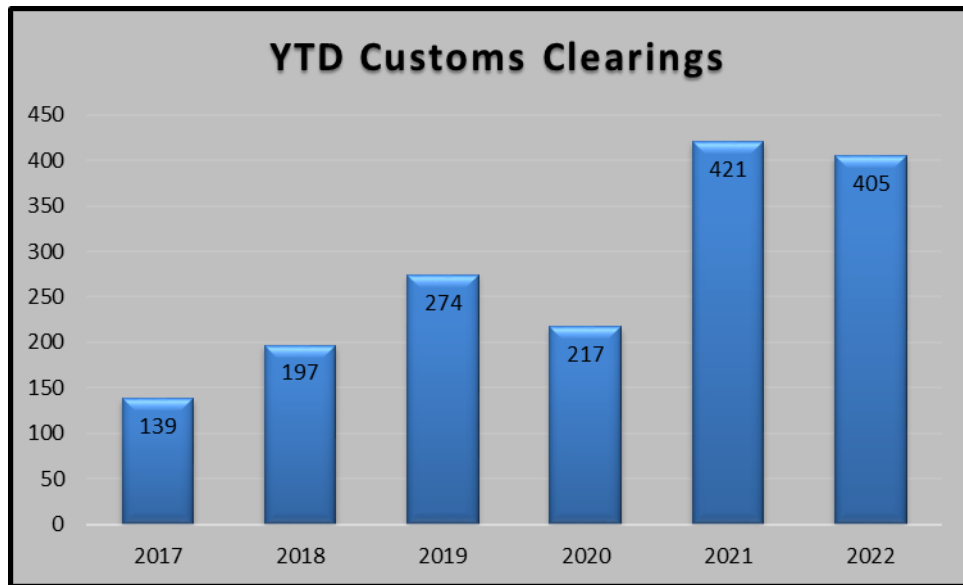
Customs Clearings Year to Date through October 2022